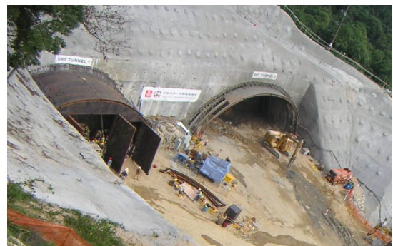
Shatin Heights tunnel South Portal

Estimated Project Cost: HK$ 1.07 billion